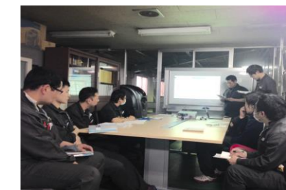
Atmosphere of environmental study tour

In 2015, we will work on the project "Changing the factory lighting to LED" as one of our activities to reduce environmental load. We will strive to reduce environmental load actively through continuous improvement of our activities in the future.